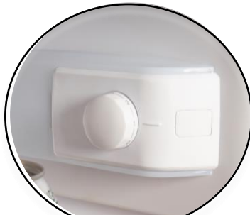
TEMPERATURE CONTROL DIALS