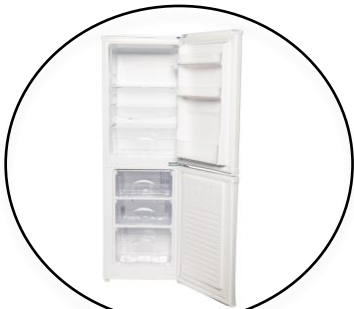
FREESTANDING 50/50 SPLIT