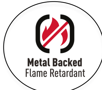
FOR EXTRA SAFETY