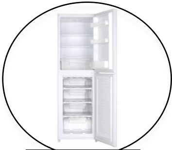
FREESTANDING 50/50 SPLIT