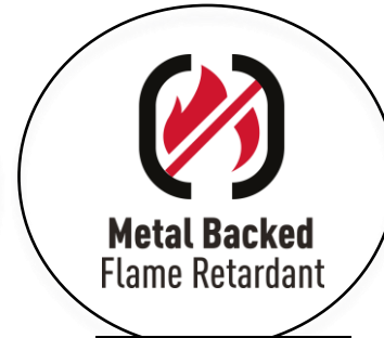
FOR EXTRA SAFETY