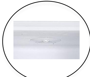
TEMPERATURE CONTROL DIALS