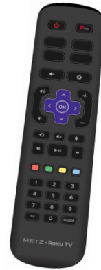
Roku TV 4k/UHD Smart TV

https://metzblue.com/fileadmin/UK/43MRD6000Z.pdf